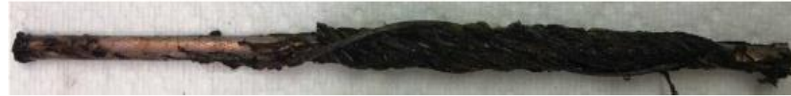
Figure 2: 7.5% HCl after 96 hours @ 194F