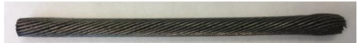
Figure 2: 33% Spearpoint-WL after 96 hours @ 194F