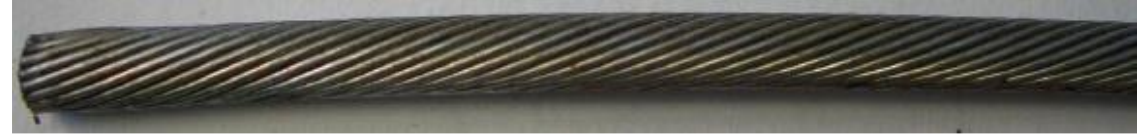
Figure 1: Untreated Wireline